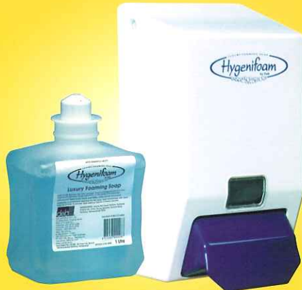
Stock code: 6000 Stock code: 2127