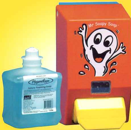
Stock code: 6000 Stock code: 2123